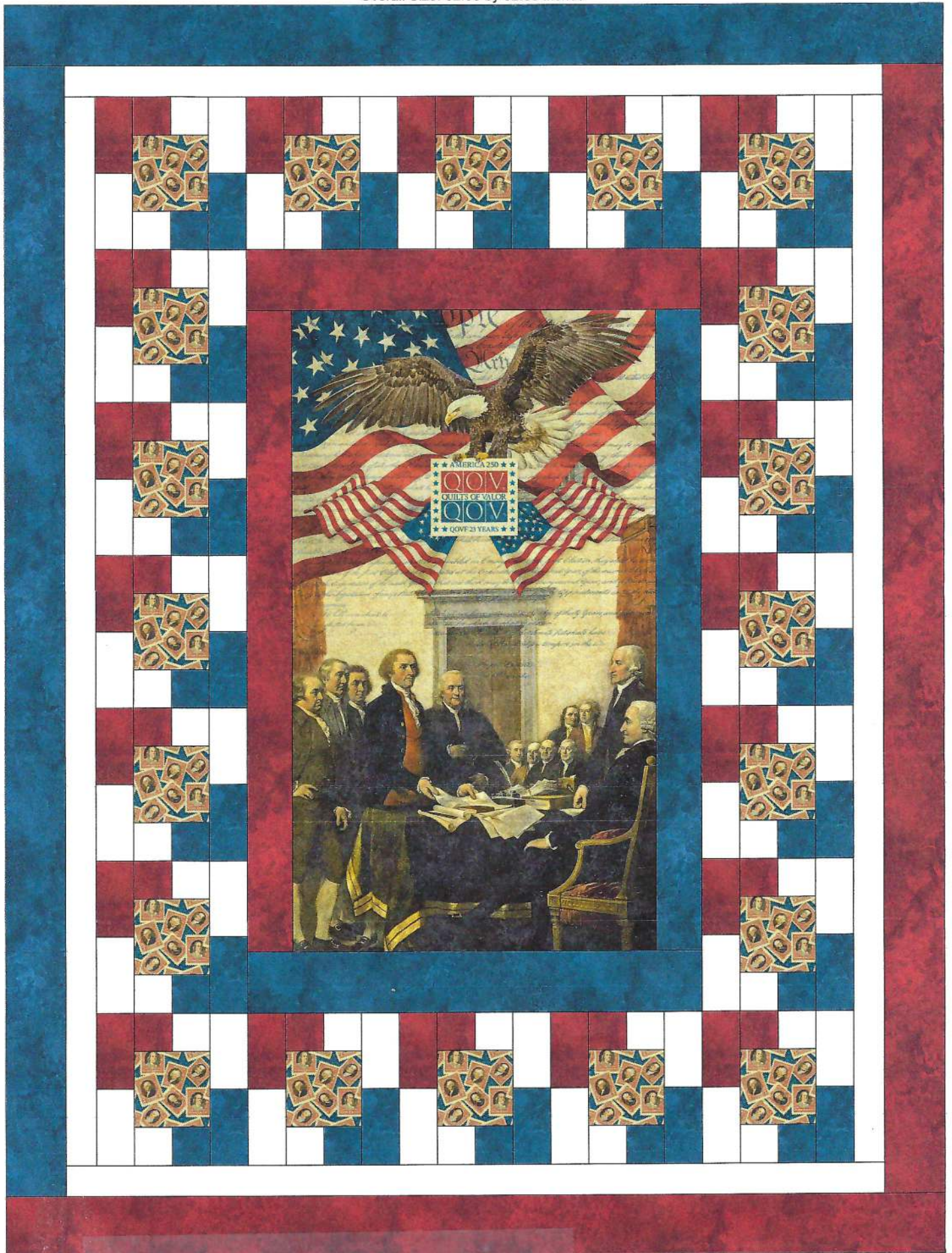
Quilt "Echoes 2 - Stamps