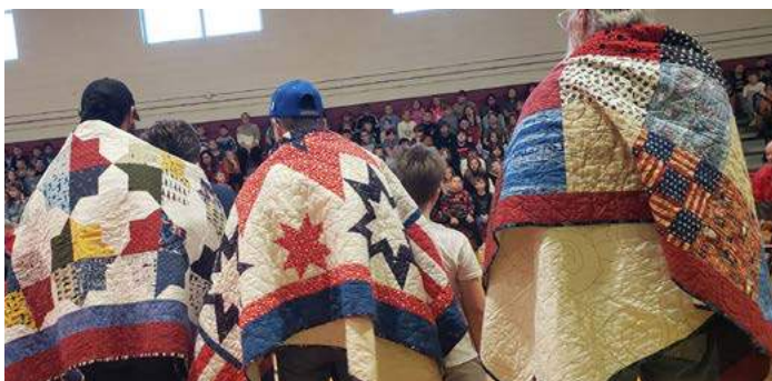
Photo is from just one of the schools where veterans are honored in November

Throughout the year, the group presents quilts to veterans following their monthly meetings. Each November, they also honor veterans at schools across the county during Veterans Day programs, ensuring students witness and participate in the celebration service.