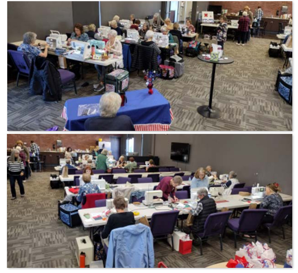
We had a great turnout for the National Sew Day for QOV 2024. Our group is Valor Quilters of Southern Utah. Our current membership is approximately 20 ladies.