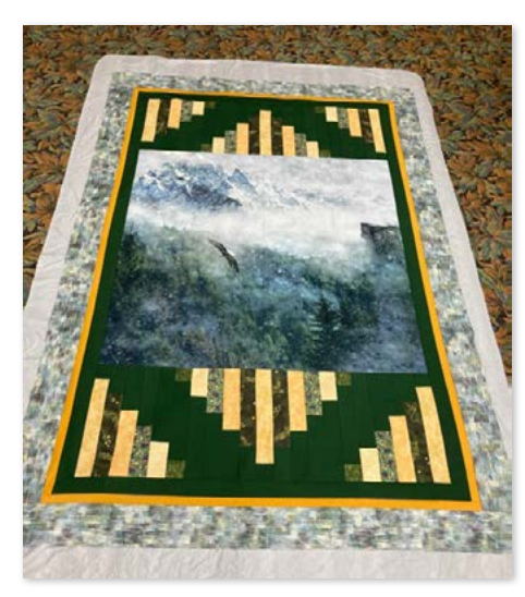
Cheryl Homme from Forget-Me-Not Quilters of Alaska, photo of Call of the Wild Panel Quilt