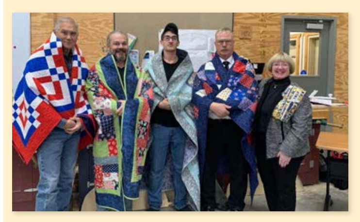
Four students at Great Lakes Boat School were awarded their QOV during a Veterans Day lunch in Cedarville, MI. Submitted by Tammy Cruickshank.