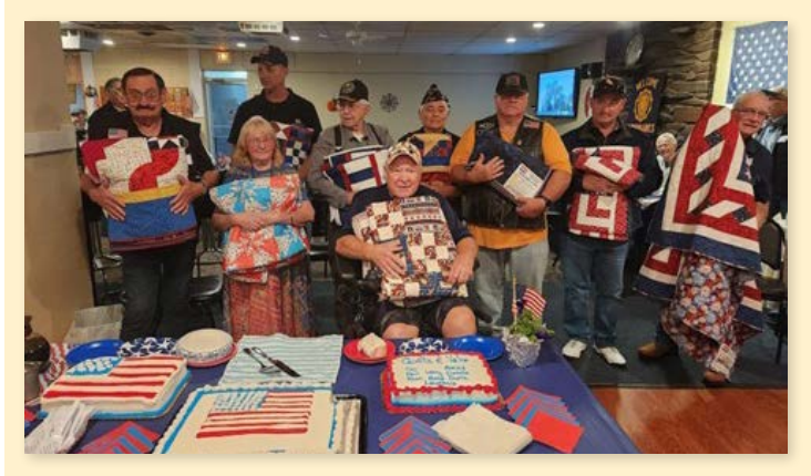
On October 14, 2023, nine veterans of the Vietnam War Era, Gulf War, OIF, and OEF were honored with comforting and healing Quilts of Valor at American Legion Post 36 by Washington's Yakima QOV.