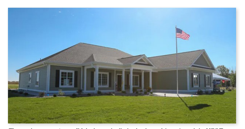
The new home near Attica, IN, built specifically for this former Marine's needs by HFOT.