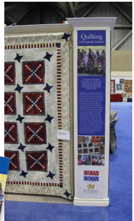
Northcott Fabrics Quilts of Valor booth display at Spring Market 2012.

Next time you purchase fabric from Northcott's patriotic group, consider telling the staff at the shop that you appreciate the company's support of Quilts of Valor Foundation.