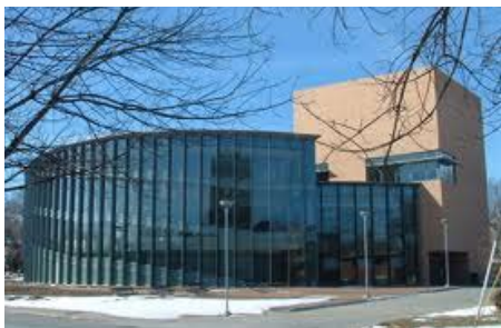
International Quilt Study Center & Museum, Lincoln, NE

Regional Coordinators can look forward to bringing back inspiration and insight to their areas to share with every volunteer within their regions. Be sure to check with your own Regional Coordinator to follow up on this exciting historic event.