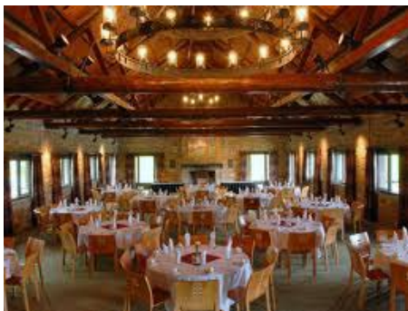
Lied Center, Nebraska City, NE

The conference includes a re-launch of our “Under Our Wings” initiative on Saturday. The weekend will be capped with a visit to the International Quilt Study Center & Museum at the University of Nebraska in Lincoln, a must-see for every quilt lover.