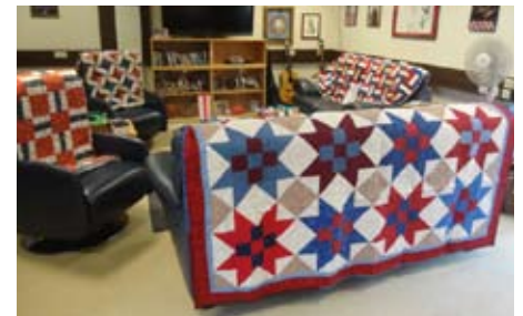
Quilts are used in gathering areas at the Contingency Aeromedical Staging Facility (CASF) at Ramstein Air Base unit.