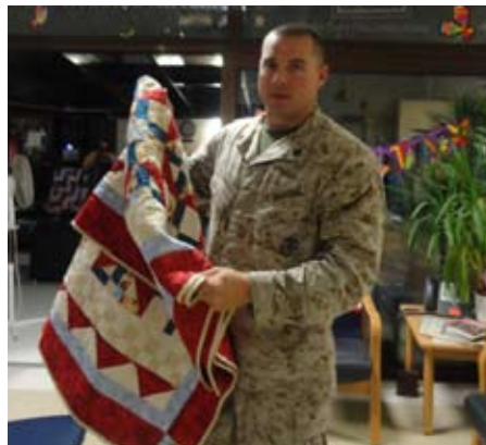
A soldier unfolds a healing quilt.