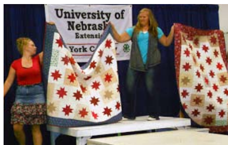
In Nebraska, York County 4-Hers display a few of the 23 Quilts of Valor they have made this summer.