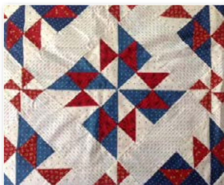
Detail of a patriotic quilt dating to the World War I years. The pattern name is unknown, but Pinwheel Star might be an appropriate choice.

Next year, 2018, will be a banner year for QOVF. It will mark the 15th anniversary of our organization and the publication of the first book about our grass roots, patriotic effort to wrap our military in quilts. Comforting our nation's soldiers with quilting is a time-honored tradition that dates to the Revolutionary War. For centuries, immigrants brought this custom to America, as well. Some early examples of war quilts from other regions include the Tristan and Isolde Quilt in the Victoria and Albert Museum in London, England, and the Intarsia quilts from across Europe and Australia. The former is a 14th Century quilt