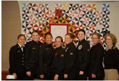
Midshipmen at the US Naval Academy learning how to quilt while working on a Quilt of Valor.